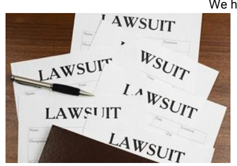
And you get a lawsuit! And you get a lawsuit! And you get a lawsuit!

patents from Canon twice before. In 2012, Canon filed complaints before the ITC and in district court accusing 34 companies of infringing a pair of patents on Canon's twisted prism gear design used in all-in-one toner cartridges (see "Reman Nightmare Realized: Canon Sues Dozens Over Infringing Gear"). After all the defendants/respondents settled with the OEM, the U.S. International Trade Commission (ITC) awarded Canon a general exclusion order (GEO) on its twisted prism gear designs in 2013 (see "U.S. ITC to Restrict Imports of Infringing Canon Gears; Alerts U.S. Customs of GEO"). The GEO Canon was awarded in the 337-TA-829 investigation is no longer enforced because the patents at issue have expired (see "Canon Says Sayonara to Twisted Prism Gear GEO").